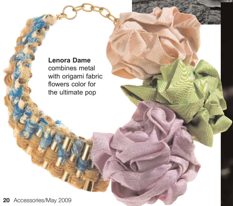
Lenora Dame combines metal with origami fabric flowers color for the ultimate pop